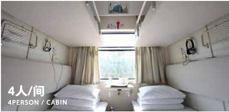
4人/间 4PERSON / CABIN