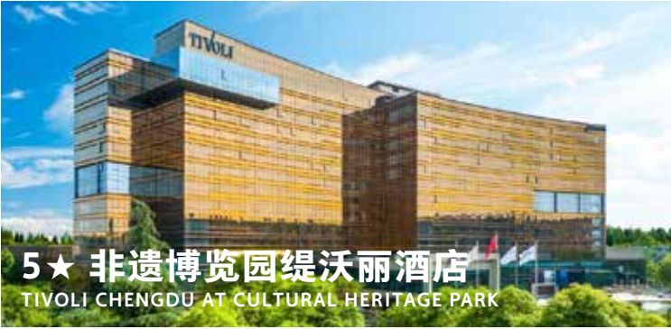
5★ 非遗博览园缇沃丽酒店 TIVOLI CHENGDU AT CULTURAL HERITAGE PARK